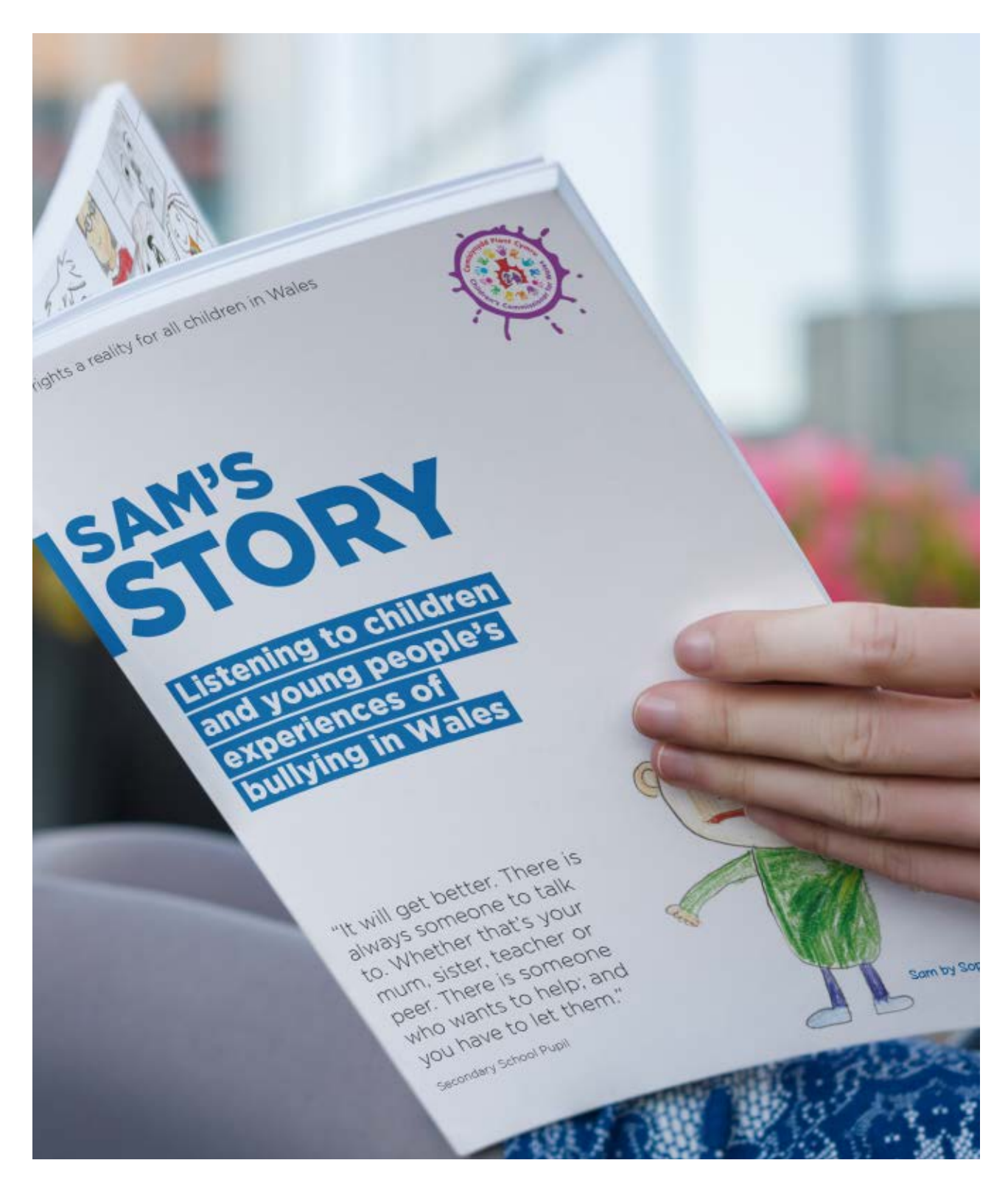
Sam's Story exhibition

Sam's Story was an exhibition organised in collaboration with the Children's Commissioner for Wales on the issue of bullying amongst young people. Visitors, young visitors in particular, were asked to engage with the exhibition by completing a Sam's Story postcard. The postcards were used to populate a report which was later published by the Children's Commissioner for Wales.