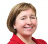
Lynne Neagle Welsh Labour Torfaen