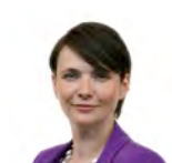
Kirsty Williams Welsh Liberal Democrats Brecon and Radnorshire