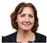
Janet Finch-Saunders Welsh Conservatives Aberconwy