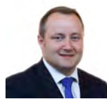
Darren Millar Welsh Conservatives Clwyd West