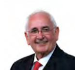
Gwyn R Price Welsh Labour Islwyn