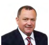
Lindsay Whittle Plaid Cymru South Wales East