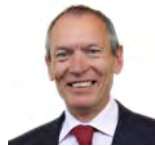
John Griffiths Welsh Labour Newport East