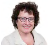
Elin Jones Plaid Cymru Ceredigion