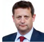
Alun Davies Welsh Labour Blaenau Gwent