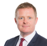
Jeremy Miles AM Welsh Labour Neath