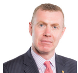
Adam Price AM Plaid Cymru Carmarthen East and Dinefwr