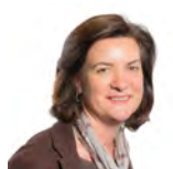
Eluned Morgan AM Welsh Labour Mid and West Wales