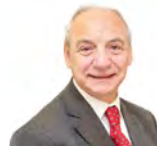
Mike Hedges AM Welsh Labour Swansea East