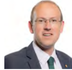
Llyr Gruffydd AC Plaid Cymru Gogledd Cymru