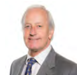
Neil Hamilton AM