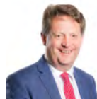
Alun Davies AM