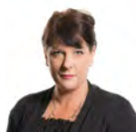
Rhianon Passmore AM