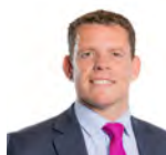
Rhun ap Iorwerth AM