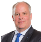
Andrew RT Davies AM