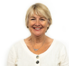
Siân Gwenllïan AM Plaid Cymru