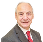
Mike Hedges AM Welsh Labour