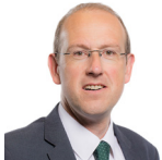
Llyr Gruffydd AM Plaid Cymru