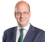
Mark Reckless AM Brexit Party

The following Members attended as substitutes during this inquiry.