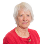
Jenny Rathbone AM Welsh Labour

The following Member was also a member of the Committee during this inquiry.