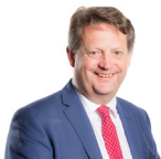
Alun Davies AM Welsh Labour