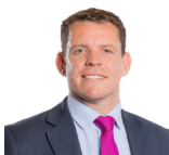
Rhun ap Iorwerth AM Plaid Cymru

The following Member was also a member of the Committee during this inquiry.