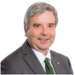
Dai Lloyd AM Plaid Cymru