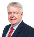
Carwyn Jones AM Welsh Labour