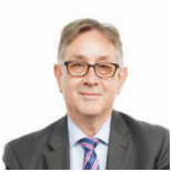
Mick Antoniw AM Welsh Labour