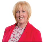
Suzy Davies AM Welsh Conservatives