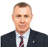
Adam Price MS Plaid Cymru

The following Member was also a member of the Committee during this inquiry.