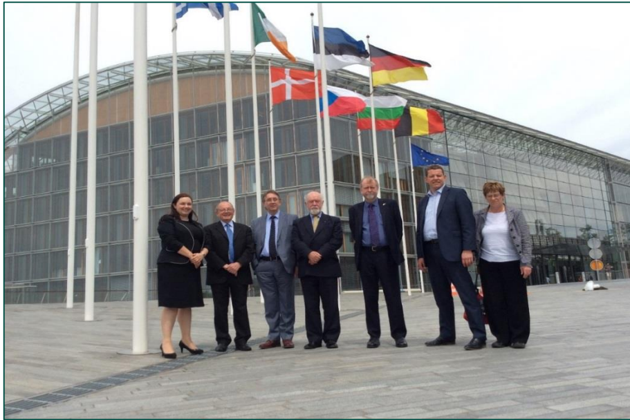
Members of Enterprise and Business Committee visiting the EIB headquarters in Luxembourg