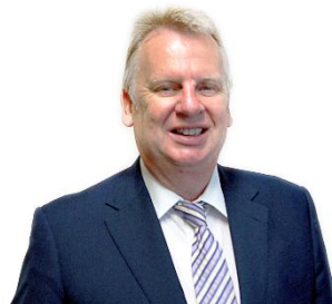
Rhodri Glyn Thomas AM