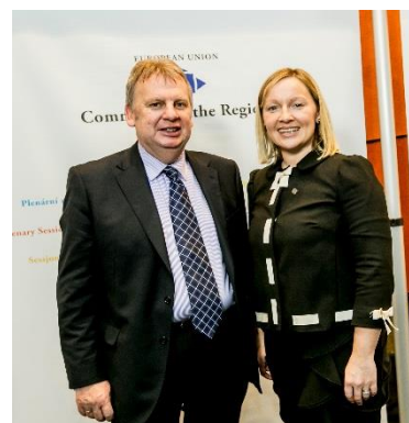
Rhodri Glyn Thomas AM with Lucinda Creighton TD, Irish Minister for Europe (2013)