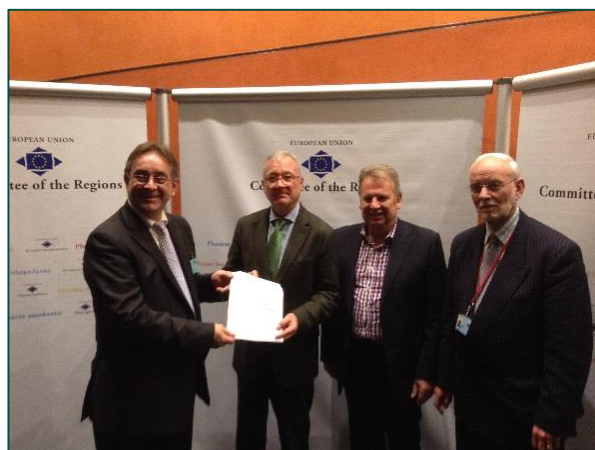
Welsh CoR members with former President of CoR Ramon Luis Valcárcel