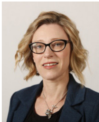
Ms Gillian Martin MSP Scotland