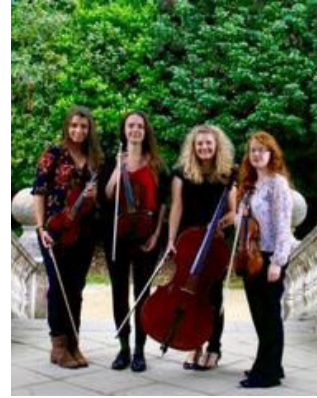
Eilan String Quartet

The Eilan Quartet formed in 2014 after meeting at the Royal Welsh College of Music & Drama. They regularly enjoy performance opportunities ranging from RWCMD Chamber Tuesdays, Cardiff National Museum, Prior Park in Bath and All Saints Church in Penarth.