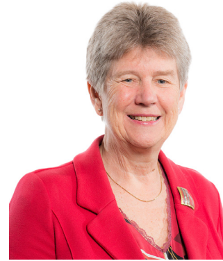
Jane Hutt AM Leader of the House and Chief Whip

Educated at the University of Kent, the London School of Economics and Bristol University, Jane is also an Honorary Fellow of University of Wales Institute Cardiff.