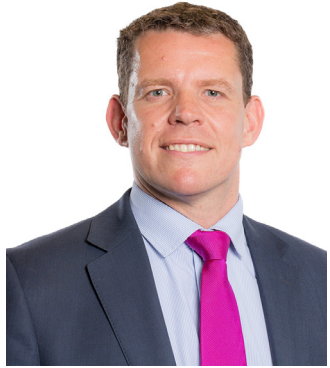
Rhun ap Iorwerth AM CPA Wales Branch Chair