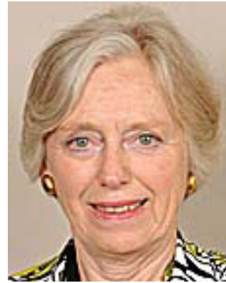
Baroness Gloria Hooper CMG United Kingdom