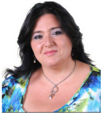
Hon Deborah Schembri MP Malta