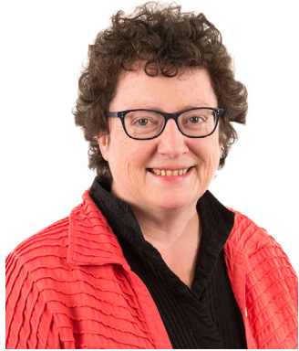
Elin Jones AM Presiding Officer

Elin Jones has been a member of the National Assembly for Wales since its creation in 1999 and she was elected Presiding Officer in May 2016. In this role she chairs the Business Committee and the Assembly Commission, as well as keeping order in Plenary meetings.