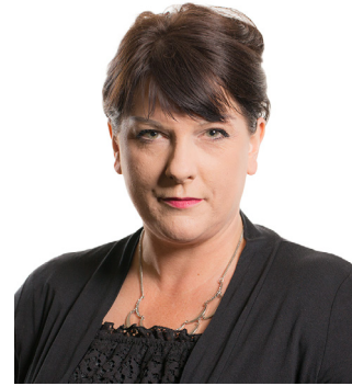
Rhianon Passmore AM Wales