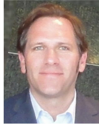
Al Davies National Assembly for Wales