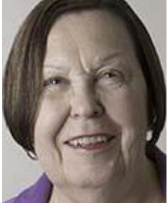
Baroness Anita Gale United Kingdom