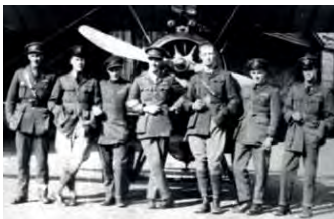
Left: Members of 37 Squadron Royal Flying Corps at Stow Maries