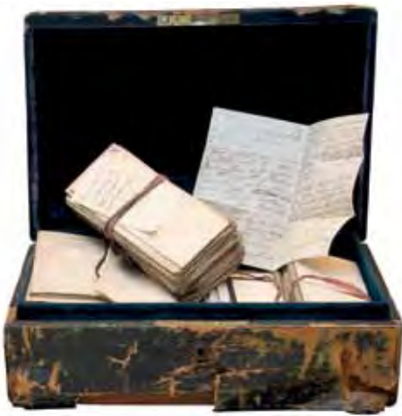
Left: George Canning's despatch box, containing bundles of letters from Lord Liverpool and other colleagues