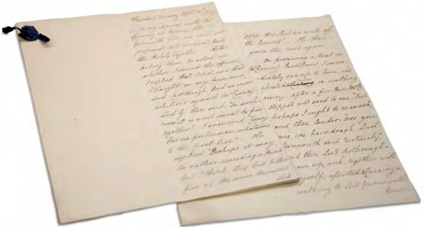
Below: An account of the duel fought between George Canning and Lord Castlereagh on Putney Heath on 21 September 1809