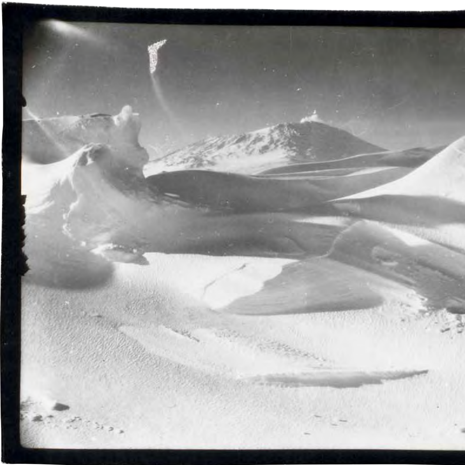
Clockwise from main image: Prints from Scott's lost negatives, showing Mount Erebus, from the sea ice; the explorers foundering in soft snow at Beardmore Glacier; Petty Officer Edgar Evans with the pony Snatcher; Herbert Ponting working in Antarctic conditions