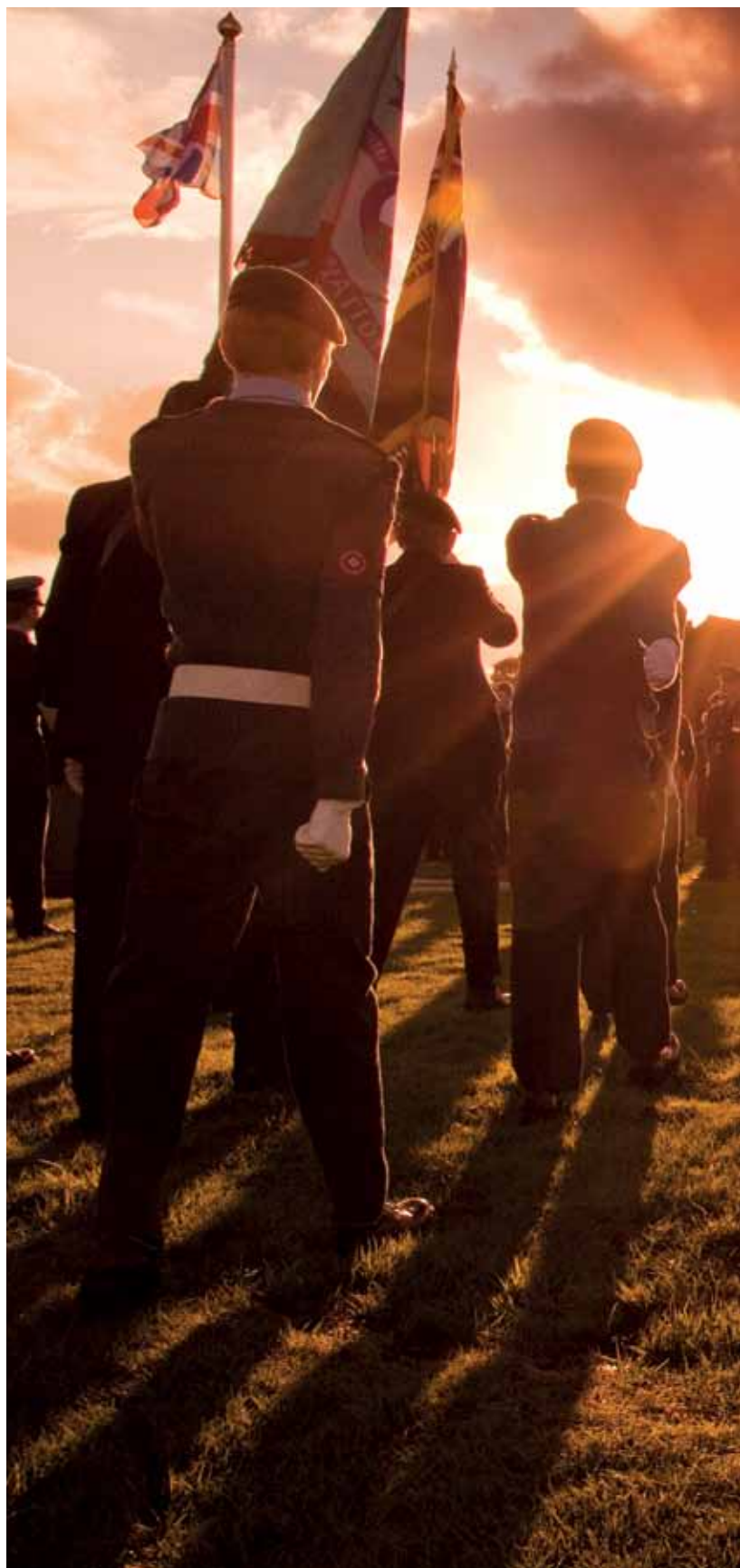
Main image: Sunset at the aerodrome on Remembrance Day

The NHMF grant allowing the Trust to acquire Stow Maries opens the way to full restoration of the aerodrome and secures the future of public access to it. There are plans to extend the educational facilities to provide an unrivalled insight into the early history of war in the air. NHMF Trustees not only aimed to preserve the integrity of this historic site but also wanted to ensure that it will continue to serve as a memorial to those heroic pioneers, the airmen of the First World War.