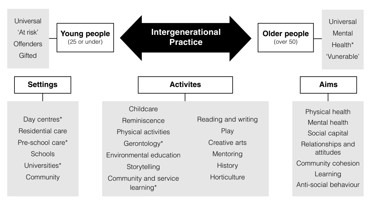
Figure 2.1 Overview of intergenerational practice

The aims of intergenerational practice in the UK are characterised by Pain (2005) as relating to the promotion of well-being (e.g. through building relationships, changing negative attitudes, increasing community cohesion), as well as to the individual project (e.g. addressing anti-social behaviour, supporting the learning of participants). In some cases, where the main aims of the projects were addressed by getting young and older people to interact together, the actual activities taking place were of secondary importance (Pain, 2005). For example, a project that involved joint outings, and aimed to improve relationships between generations, understanding and well-being (Home First