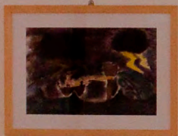
Artwork by [illegible]