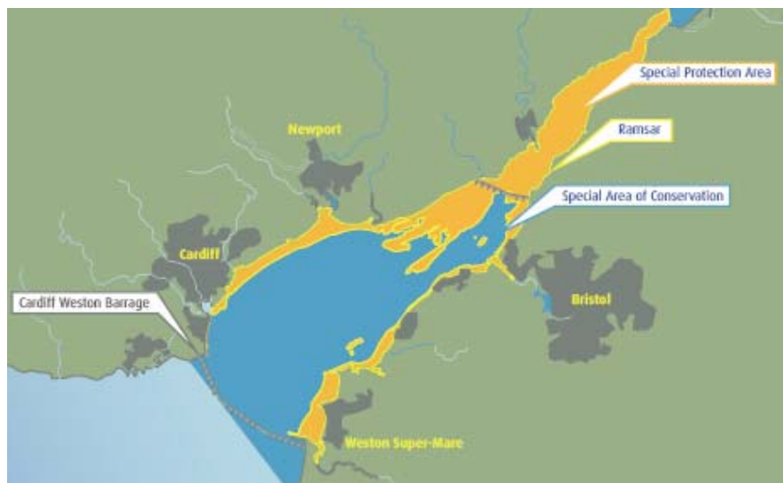
Figure 1. Showing areas of high value habitats and their international protection 39

The large Cardiff-Weston barrage is likely to have far reaching direct and indirect effects on terrestrial and freshwater ecology within the Severn Estuary. Wetland sites and species that rely on areas with specific hydrological regimes are likely to be most affected, however all habitats and species will be affected to some degree. 37 Terrestrial habitat loss is a certainty for all STP options however it is expected that the Cardiff-Weston barrage will result in the greatest loss both as a result of the large construction process and from the reduction of tidal range over the large area. 38