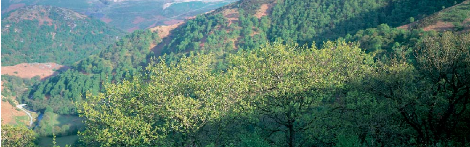
Allt Rhyd y Groes NNR

Two other important soils initiatives have required our input. We have helped the Environment Agency with the publication of their report on the State of Soils in England and Wales, and their associated strategy for soil protection, management and restoration; and we have helped the Wales Assembly Government (WAG) to develop a soil strategy for Wales, the key messages from which will be incorporated into the Assembly's Environment Strategy.