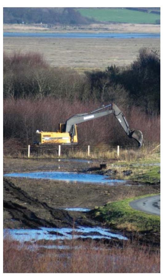
Scrub clearance at Pembrey sands

This kind of work can seem remote to peoples' lives, but nature is just as much a presence in towns and cities, where it can improve the quality of life, as in the countryside. We have worked with local communities during the year, recognising that restoring wildlife encourages sustainable living, as people feel less need to travel to find places for quiet recreation, and has health and economic benefits.