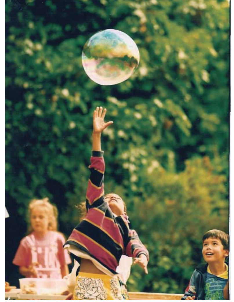
Children at Eco-fest at Rosehill Quarry – Rosehill Quarry Group

We also monitored the impact on businesses of Adfywio, the £5.2 million grant scheme funded by WAG, and managed jointly by ourselves and the Wales Tourist Board (WTB), with additional support from the Forestry Commission (FC). It aimed to stimulate rural economic recovery following the foot and mouth outbreak. This evaluation showed that the £5.2million