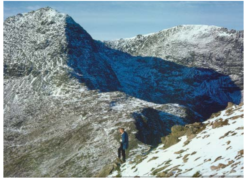
Snowdon, Crib Ddisgl from Lliwedd

the current state of our response to climate change and we are now developing recommendations and an action programme for us to undertake in future.