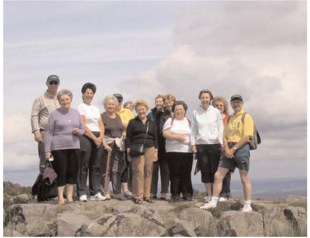
Torfaen Walking the Way to Health Group

We have made a fundamental change to the way that we plan our work. All our work comes under one of five broad headings or 'themes', which form the chapters of this report. Five 'theme groups' have been established, which are able to look at priorities across the organisation rather than within the different parts of the organisation's structure. The result is that we are able to plan our work in a more integrated way and that we communicate better with each other in developing our plans to deliver better outcomes. The first year of working in this way had its fair share of problems, but we will learn from these, and we are confident that we have the building blocks for a more transparent and inclusive way of delivering our objectives.