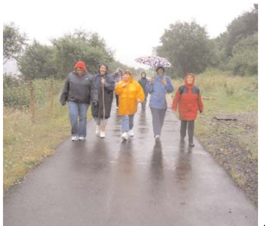
Walking the Way to Health Project, Tredegar

As well as delivering health benefits, the countryside is a source of mental stimulation and endless fascination. Careful interpretation can bring the natural heritage to life, so that visits to the countryside become an enriching experience. Accordingly we have continued to support Dehongli Cymru / Interpret Wales (DC/IW), a steering group of the main agencies in Wales