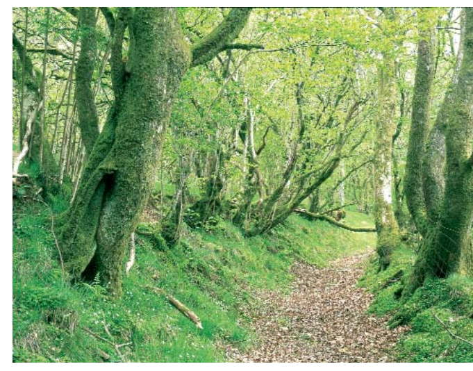
Allt Rhyd y Groes NNR – CCW/David Woodfall

Designation of sites of particular importance for wildlife and geology as Sites of Special Scientific Interest (SSSIs) is a crucial step towards their protection, but it is not the end of the story. They need positive management of a kind that is quite different from the farming and forestry practices which many of their owners and managers wish to follow. Reaching agreements which allow for positive conservation action on SSSIs has been the subject of an ambitious target for the year - to increase the area of SSSIs under sympathetic management by 5,000 hectares. We have comfortably exceeded this, thanks to cases like the following.