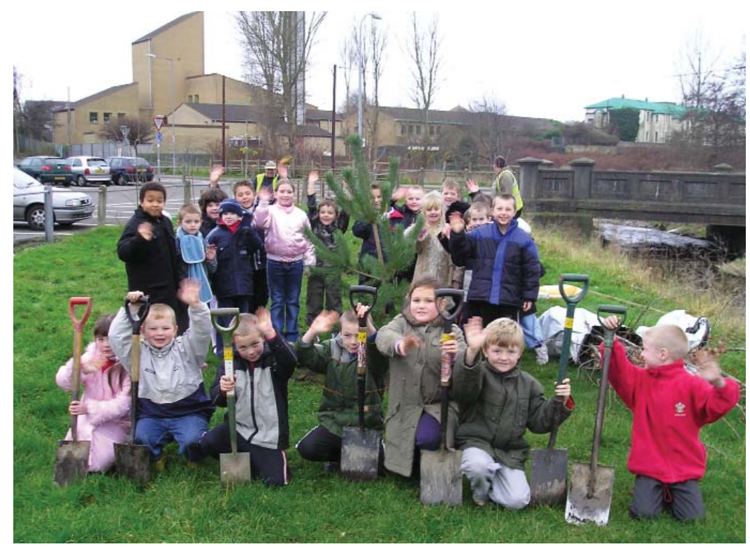
Afon Lliedi project, an intergenerational project involving the Health and Wellbeing Project of Penygaer Primary School

have been keen and active in discussions, achieving a sense of empowerment and assisted through the design and grant aid process by officers of various bodies.