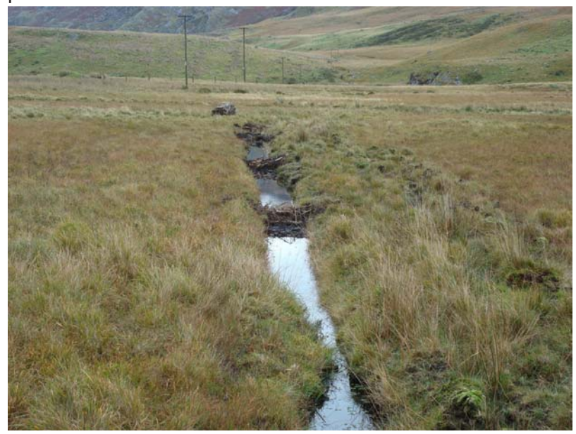
Ditches blocked on Dyffryn Mymbyr to raise water levels and reduce erosion

The National Trust will: Restore, create and conserve carbon banks on its land in soils, peat and woodland.