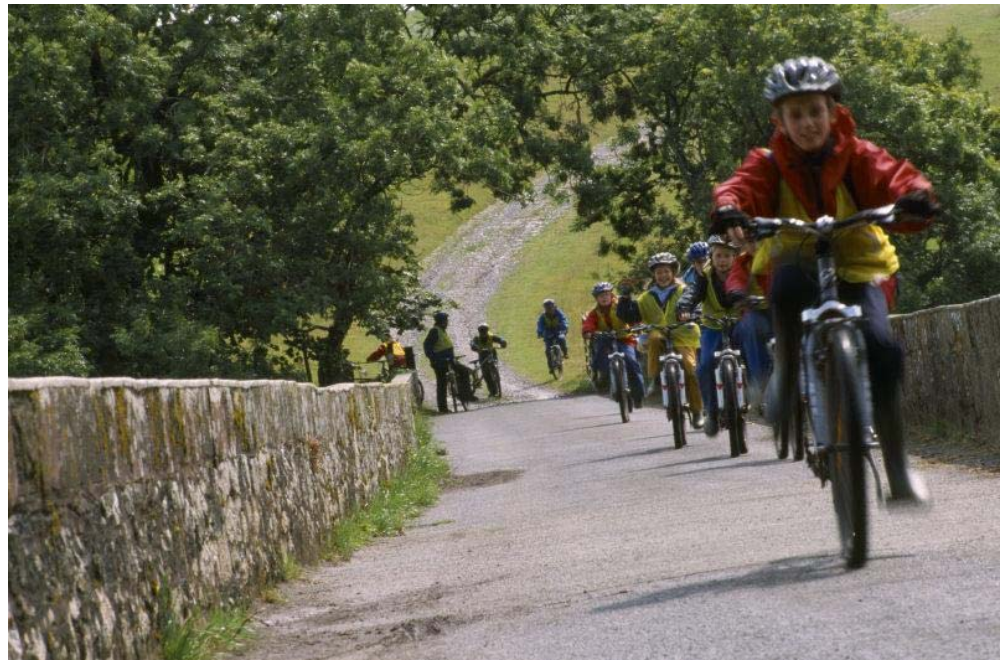
Young visitors cycling round Stackpole Estate