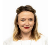
Bethan Sayed MS Plaid Cymru