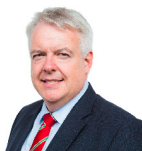
Carwyn Jones MS Welsh Labour