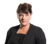
Rhianon Passmore MS Welsh Labour

The following Member attended as a substitute during this inquiry.