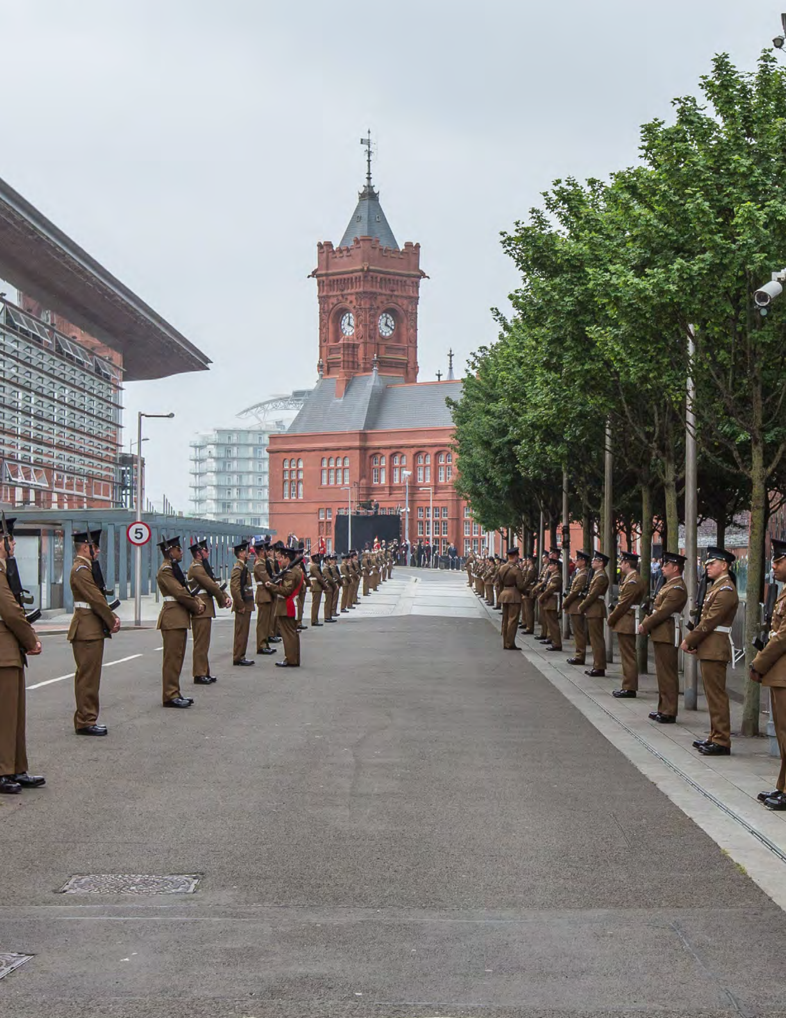
The Official Opening of the Fifth Assembly - 7 June 2016 Members of the Armed Forces line the street outside the Senedd.