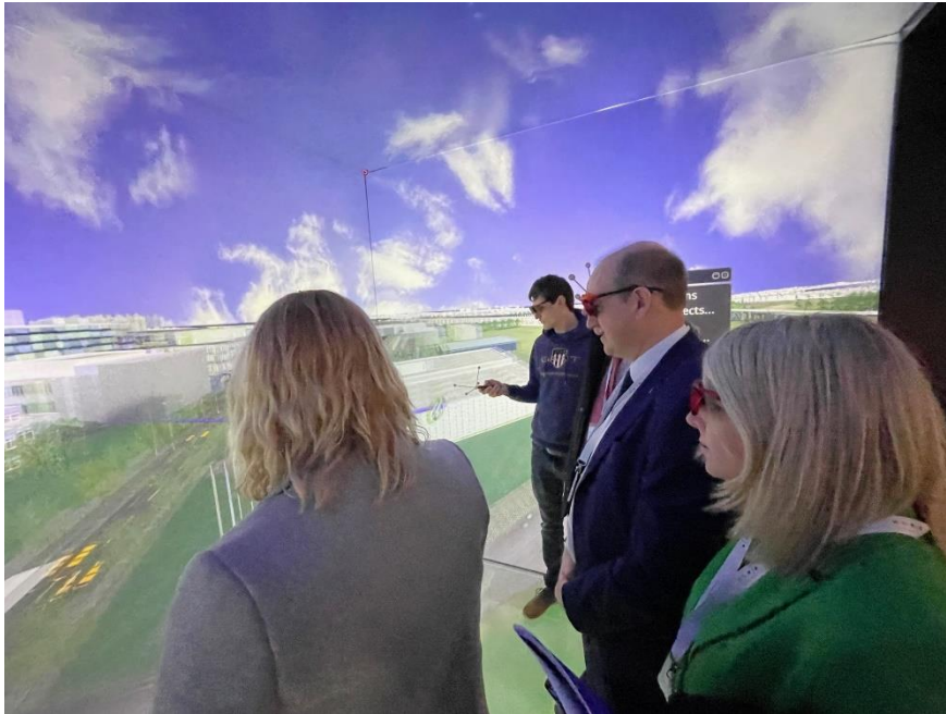
Members at HLRS's Cave facility – an AI Simulation centre.

The visit to Stuttgart and the Baden-Wurttemberg Landtag was delivered as part of the Senedd's International Framework, which puts Senedd Business at the heart of international activity, and with the ambition to develop and strengthen links at state-parliament level in Germany during this Sixth Senedd and beyond into future Seneddau.