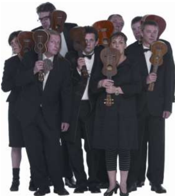
UKULELE ORCHESTRA OF GREAT BRITAIN

Aberdare Boys' School Aylestone School, Hereford Bishopston Comprehensive, Swansea Blaengawr Comprehensive, Aberdare Brecon High School Builth Wells High School Christ College, Brecon Crickhowell High School Crickhowell Primary Cylch Meithrin, Abergavenny Cymer Afan Comprehensive, Port Talbot Fynnon Gynyd School Gladestry School, Kington Gollop Prep School, Gwernyfed High School Heolgerrig Primary, Merthyr Tydfil Hereford Cathedral School Irfon Valley Primary King Henry VIII, Abergavenny Lady Hawkins' School, Kington Llanbedr School Llandaff Cathedral School Llandovery College Llanfaes School, Brecon Llangattock Primary Llangynidr School Ludlow High School Merthyr Tydfil Primary Mount Street Infants, Brecon Nantyglo Comprehensive Pontygof Primary Priory School, Brecon Queen Elizabeth, Bristol Radyr Comprehensive, Cardiff Sennybridge School St Cenydd Comprehensive, Caerphilly St Joseph's School, Brecon St. Illtyd's Primary Steiner Academy Hereford Trefonnen School, Llandrindod Weobley High School Wydean School, Chepstow Ysgol Gymraeg Y Fenni Ysgol Penmaes, Brecon Ysgol Rhys Pritchard Ysgol Y Bannau, Brecon Dowlais Engine House, Merthyr Tydfil Allsorts Playgroup, Brecon