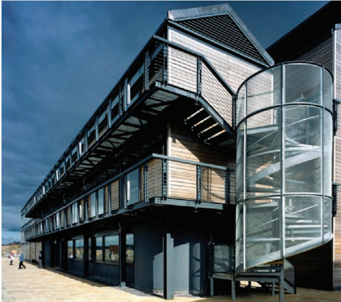
Galeri Caernarfon

£8.2 million towards the £13.5 million cost of the new Riverfront Theatre and Arts Centre, which opened in October 2004 (Case Study Q). And in Caernarfon, the Arts Council contributed £2.9 million towards the £7.4 million cost of the new Galeri Caernarfon, which opened in March 2005 (Case Study R).