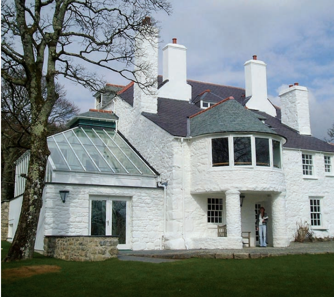
Ty Newydd Writers' Centre

2.17 The assessment of organisational capacity in relation to applications for major capital grants is done by Arts Council officials, drawing on internal knowledge and information about applicant organisations, particularly where these are existing revenue clients of the Arts Council. Arts Council officials do, however, refer to and draw on external assessors' reports for additional insight on capacity issues, particularly the business consultant's review of the organisation's business plan. Where organisational capacity concerns arise, the Arts Council may support its capital grant applicants or recipients in two main ways: