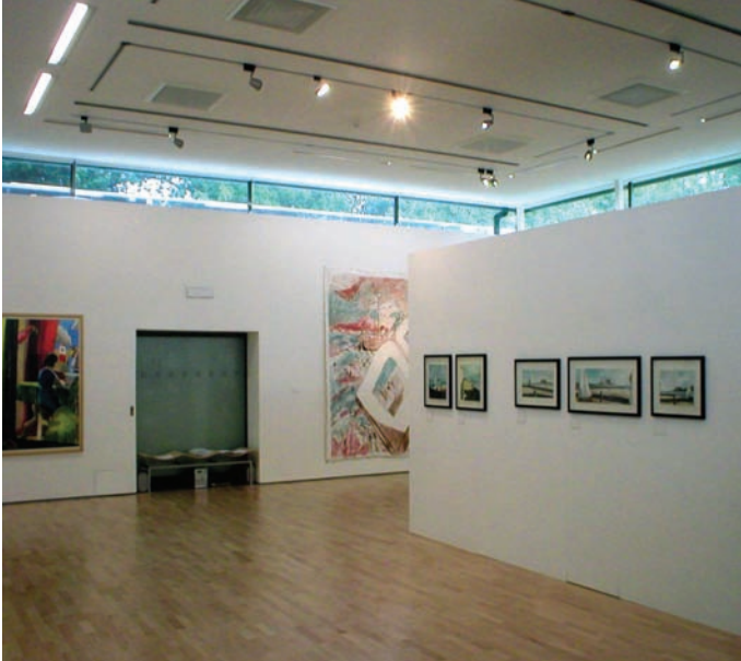
Oriel Davies

(the monetary size of its capital grant awards) as a proxy for financial and operational risk. However, given that individual major capital grants in the eight years 1999-2000 to 2006-2007 have been from £50,000 to £8 million per award, with an average of £800,000 in total awards per project, there may be a case for the Arts Council to review the level of its existing thresholds, which would seem to be set too low and reflect an over-cautious approach. The impact of this would be to lessen the internal administrative burden for the Arts Council in processing grant applications and awards.