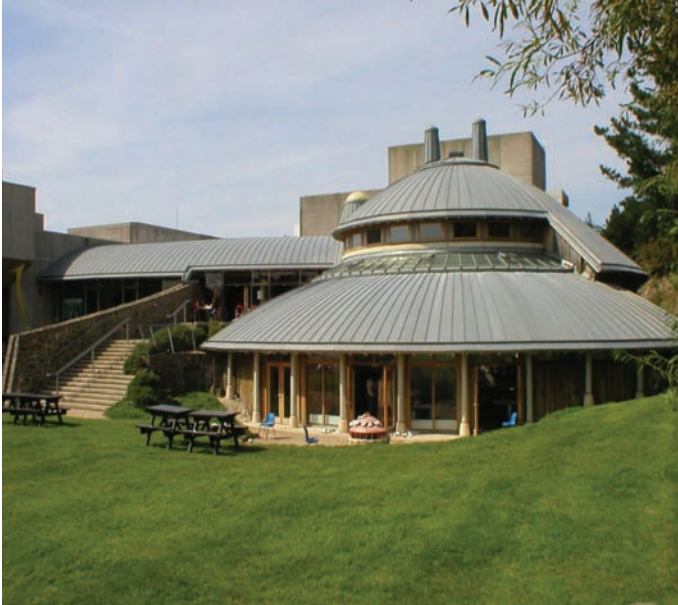
Aberystwyth Arts Centre