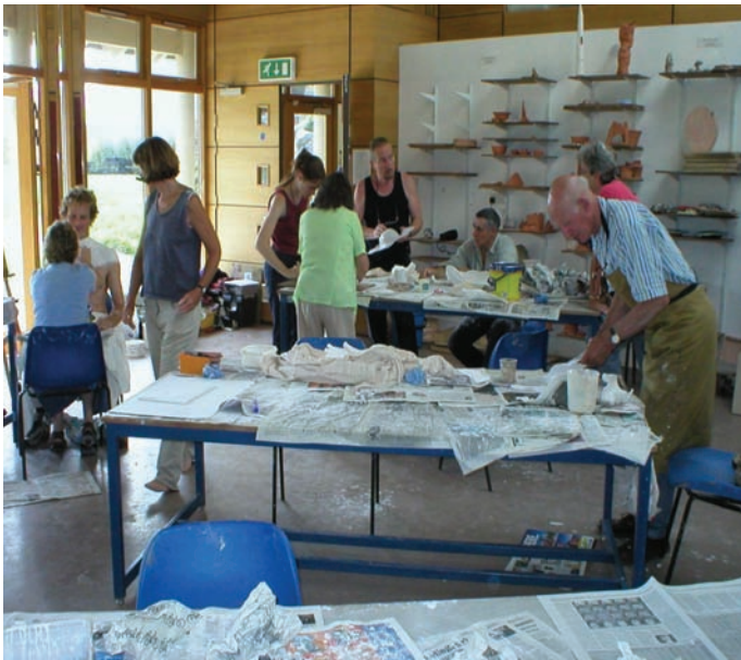
Activity at Aberystwyth Arts Centre