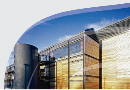
Figure 4: The Arts Council's capital project assessment criteria cover a wide range of factors