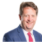
Alun Davies AM Welsh Labour