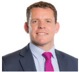
Rhun ap Iorwerth AM Plaid Cymru