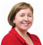
Lynne Neagle AM Welsh Labour Torfaen