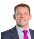
Rhun ap Iorwerth AM Plaid Cymru Ynys Môn