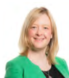
Jayne Bryant AM Welsh Labour Newport West