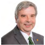
Dai Lloyd AM Plaid Cymru South Wales West