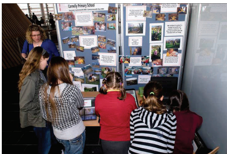
The Cornelly Primary School show their display to Ysgol Greenhill School.