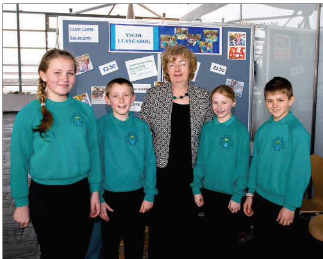
The Ysgol Llangadog group.