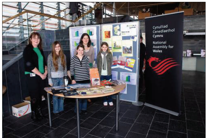
The Assembly's Green Team and Greenhill School