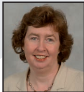
Helen Mary Jones Llanelli