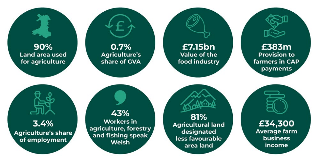
Figure 1: Welsh farming statistics (figures are for 2019, 2020 or 2021, depending on the most current available)