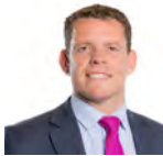
Rhun ap Iorwerth AM Plaid Cymru Ynys Mon