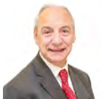
Mike Hedges AM Welsh Labour Swansea East