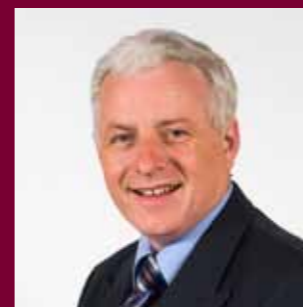
Chris Franks AM, Commissioner for the Improving Assembly

The Llywydd has special responsibility for encouraging the people of Wales to engage in the democratic process, encouraging effective leadership within the Assembly, developing the future legislative powers of the Assembly and promoting effective engagement with external stakeholders.