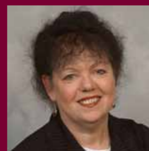
Lorraine Barrett AM, Commissioner for the Sustainable Assembly

Peter is responsible for ensuring the Assembly is effective when it undertakes its core roles of holding the Welsh Government to account and making laws for Wales. In addition, he oversees effective external communication initiatives, which include educating people about the Assembly's role, the provision of effective information and communication technology for the Assembly and lawfulness.