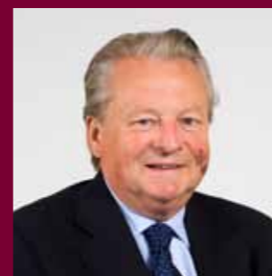
The Rt Hon the Lord Elis-Thomas PC AM, Llywydd of the National Assembly for Wales

For more information, visit the Commissioners' pages on the website.