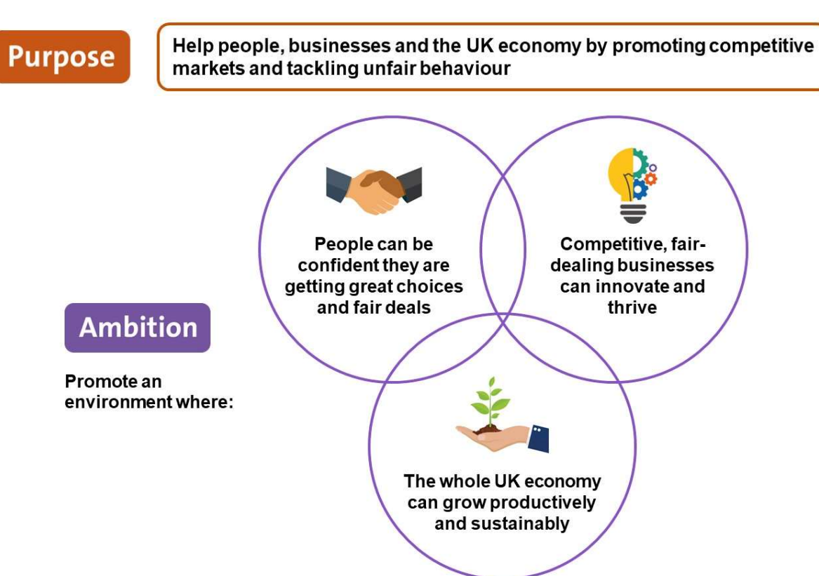
Figure 1 The CMA's purpose and ambition

3.2 We provide more detail on this and on our ambition, which sits beneath our purpose, in the following two sections.