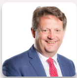
Alun Davies MS Welsh Labour