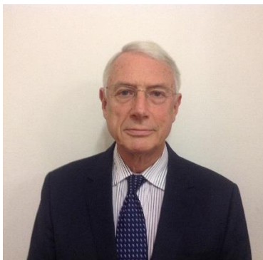
Sir Roderick Evans

Email: Standards.Commissioner@assembly.wales