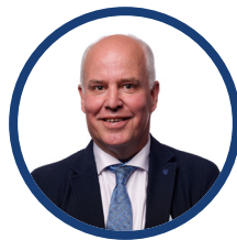
Andrew RT Davies

Y Ceidwadwyr Cymreig Welsh Conservatives