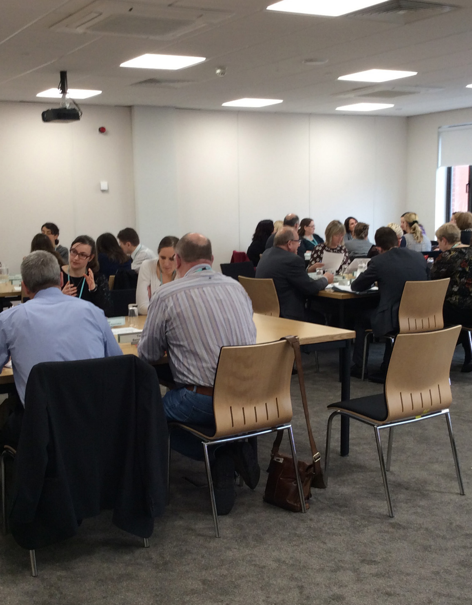
Draft Additional Learning Needs and Education Tribunal (Wales) Bill Round table workshop with key stakeholders, November 2015