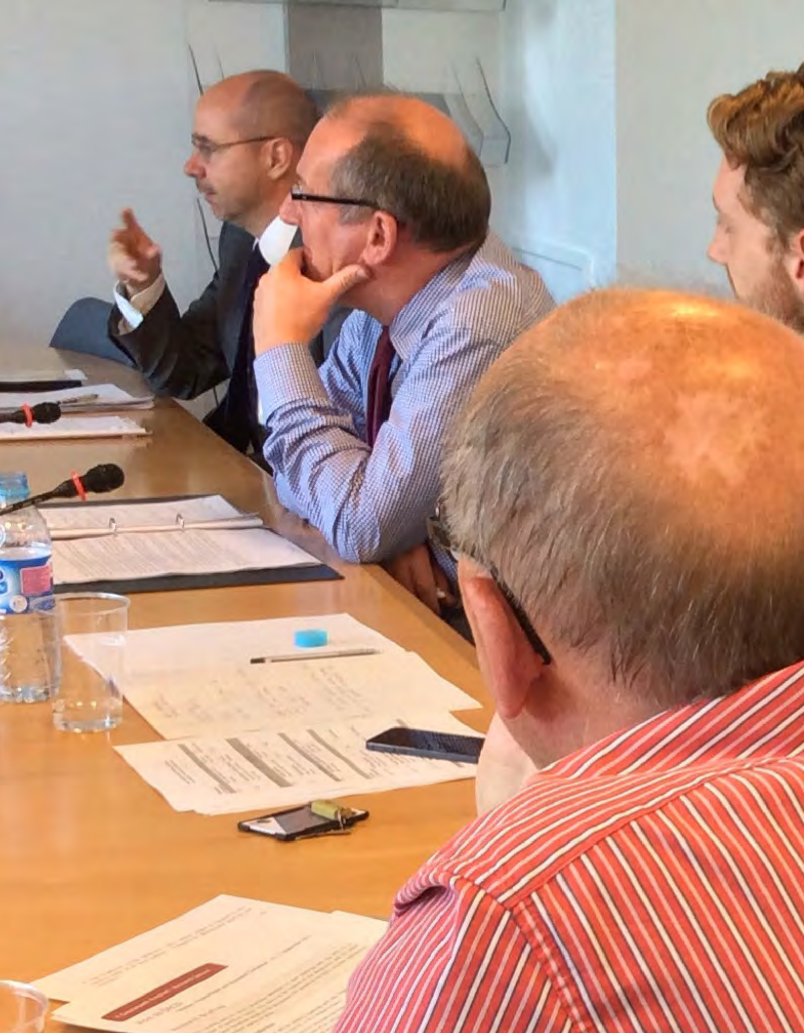
Committee visit to the Organisation for Economic Co-operation and Development (OECD), Paris, September 2014