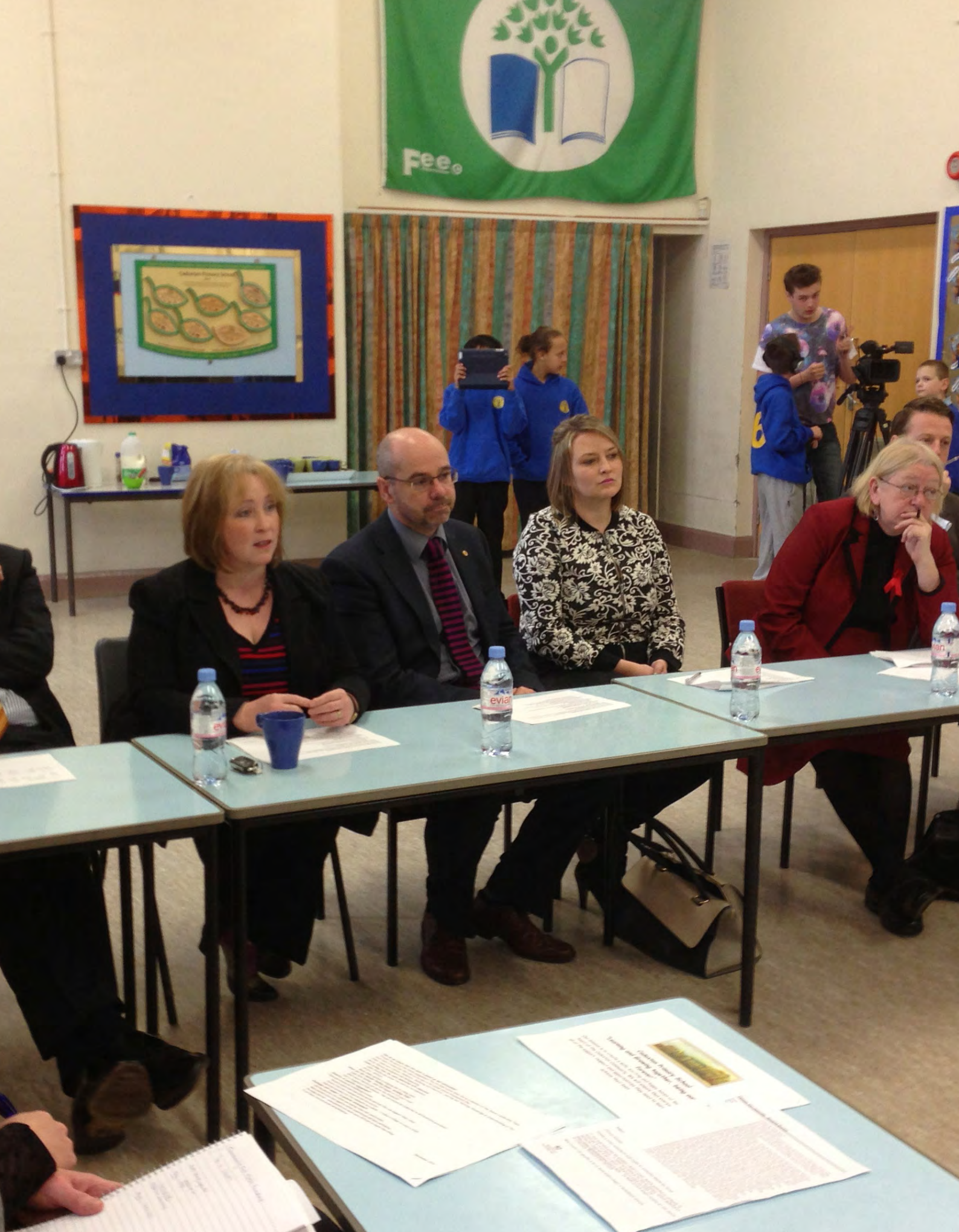
Inquiry Into Educational Outcomes For Children From Low Income Households Committee visit to Cadoxton Primary School, Barry, November 2013