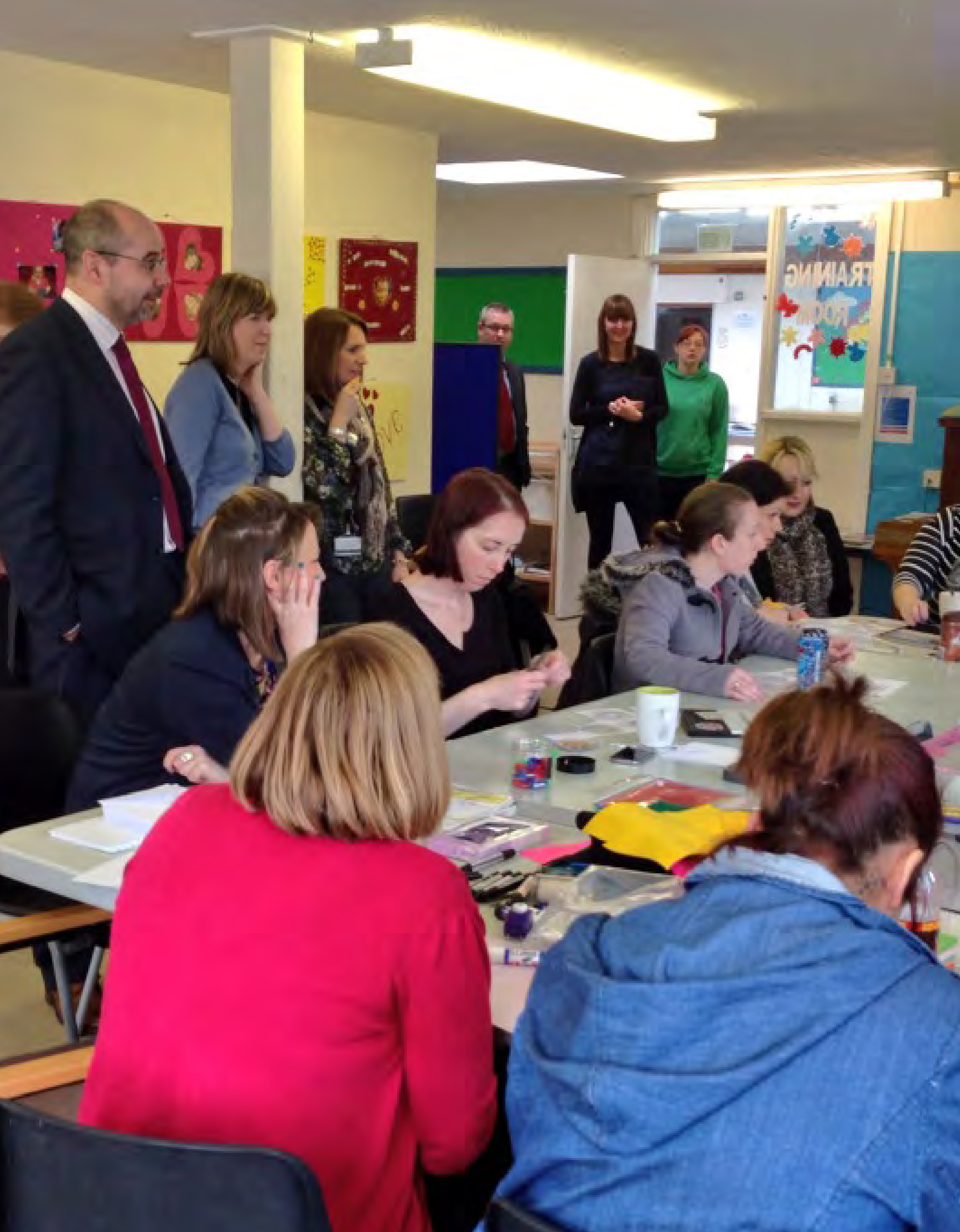
Inquiry Into Educational Outcomes For Children From Low Income Households Committee visit to a family centre in Bonymaen Swansea, February 2014