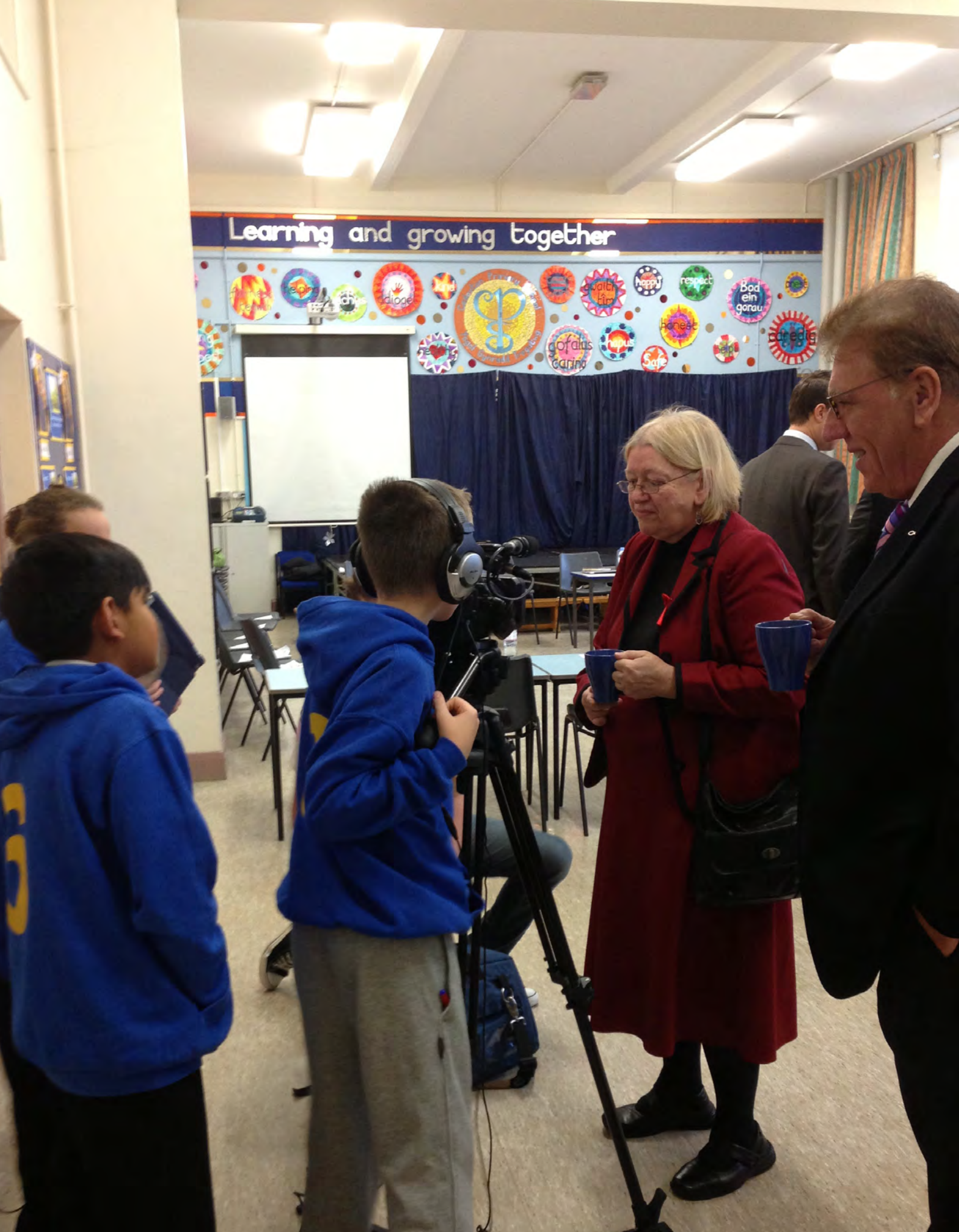
Inquiry Into Educational Outcomes For Children From Low Income Households Committee visit to Cadoxton Primary School, Barry, November 2013