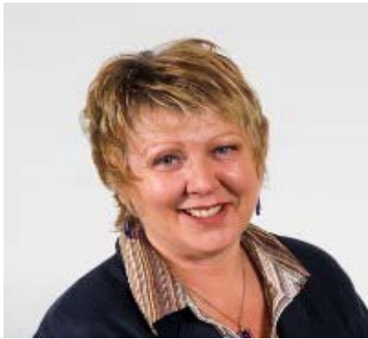
Eleanor Burnham North Wales Welsh Liberal Democrats