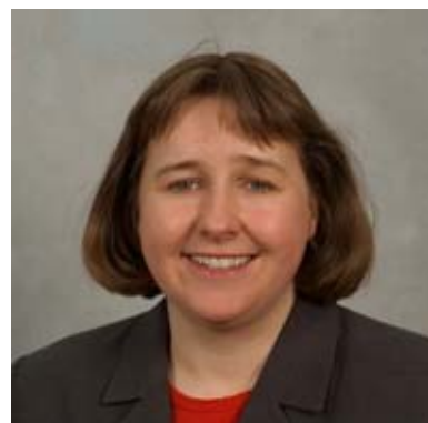
Lynne Neagle Torfaen Labour