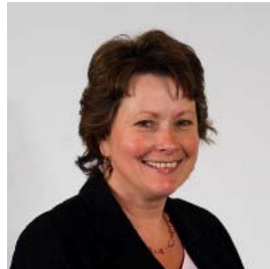
Angela Burns Carmarthen West and South Pembrokeshire Welsh Conservative Party