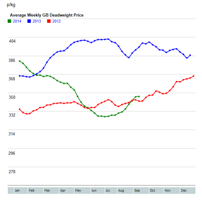
Figure 1. Average weekly GB market price for steers. 7

Decreasing farm-gate prices in 2014 in Wales have been reported to equate to a loss of up to £300 per animal compared to 2013.<sup>6</sup>