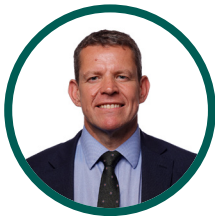
Rhun ap Iorwerth

You can contact any of them, no matter who you voted for.