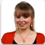
Committee Chair: Delyth Jewell MS Plaid Cymru