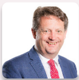
Alun Davies MS Welsh Labour