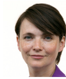
Kirsty Williams Welsh Liberal Democrats Brecon and Radnorshire