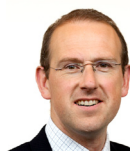
Llyr Huws Gruffydd Plaid Cymru North Wales