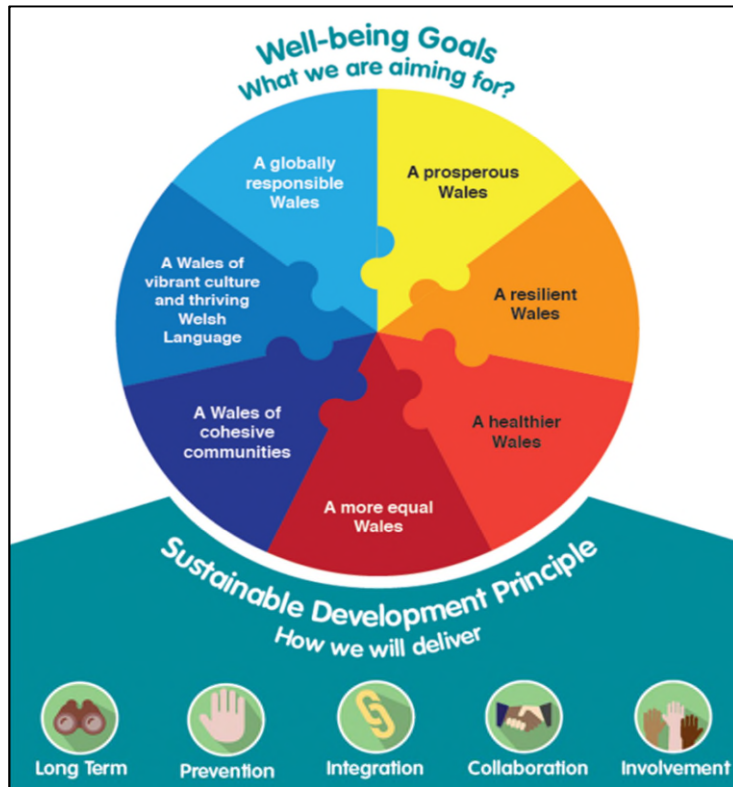
Figure 2: Well-being of Future Generations (Wales) Act 2015, Well-Being Goals and Sustainable Development Principle

Equally, the Sustainable Development Principle with its five ways of working are fundamental to the way in which active travel interventions should be planned and delivered: