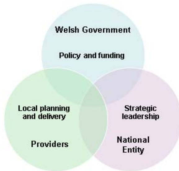
Illustration 2: Inter-relationship between the Welsh Government, the National Entity and the Providers