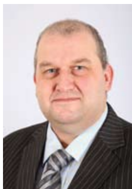
Carl Sargeant AM

Much of the work set out in the Third Dimension will come to fruition in the period covered in next year's report. I look forward to another year of successful partnership working between the Welsh Assembly Government and the Third Sector.