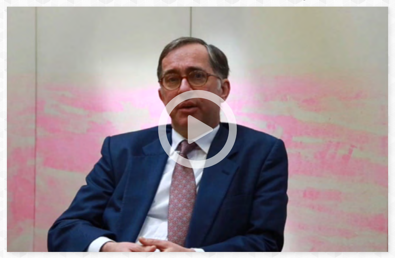
View online: https://youtu.be/Bv33iHq7OAU

The five current members talk about the role and work of the Constitutional and Legislative Affairs Committee.