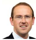
Llyr Huws Gruffydd Plaid Cymru North Wales