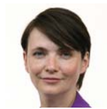
Kirsty Williams Welsh Liberal Democrats Brecon and Radnorshire

The following Member was also a member of the Committee during this inquiry: