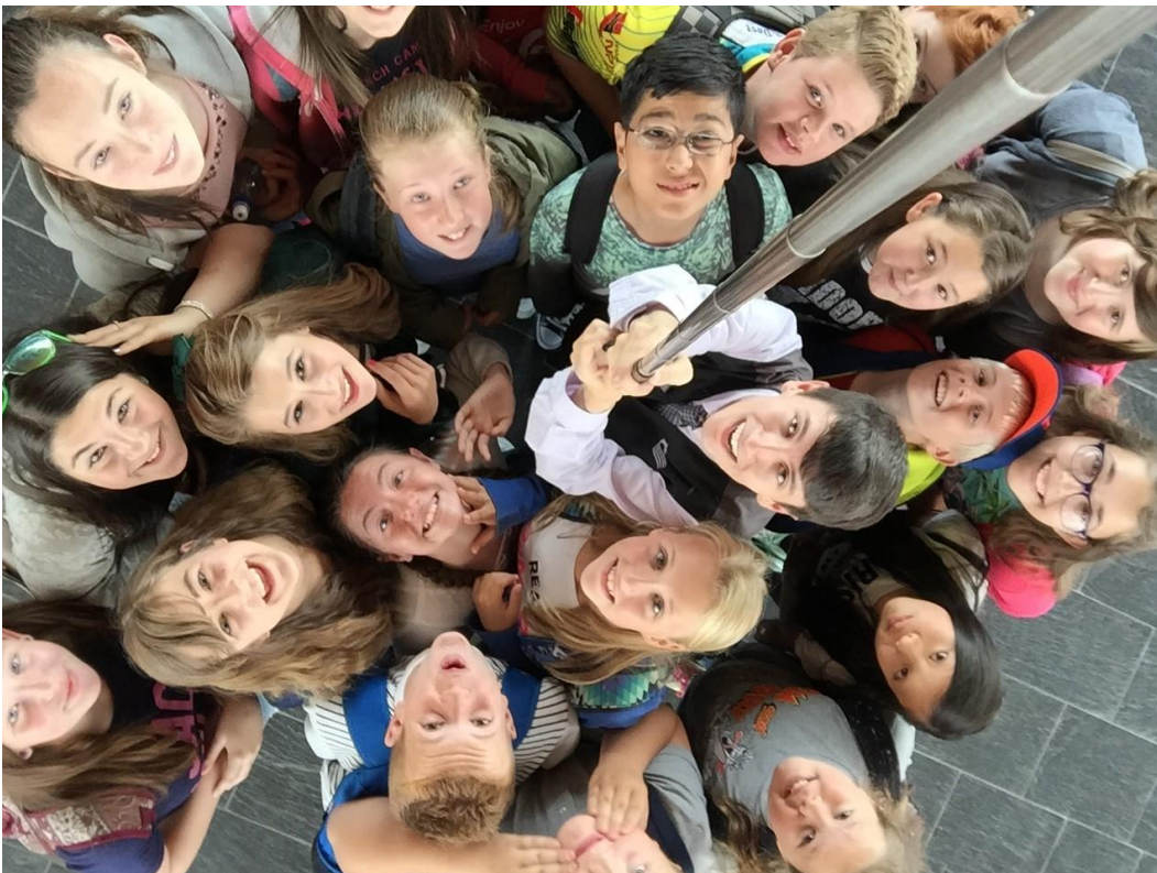
Visitors join our tour manager to pose for a Senedd selfie

We always make reasonable adjustments upon request for visitors. This year, adjustments have included adjustments to tours for visitors with mobility impairments.