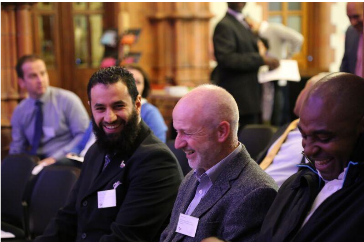
Assembly staff at a Black History Month celebration

We continue to look at how we share information on job opportunities with their service users and contacts. To help increase engagement with BME people and improve the visibility of the Assembly as an employer of choice, the REACH network participated in a number of external events including launching the inaugural meeting of the Public Sector BME Network Wales.