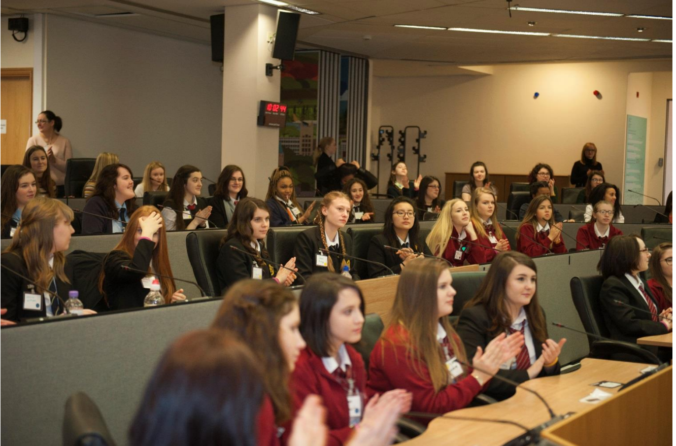
Attendees at an International Women's Day event as part of the Presiding Officer's Women in Public Life campaign.

At the 'Assemble the Youth Conference' on 15 July 2015, 27 groups of young people came together to debate the outcomes of the Presiding Officer's 'Vote@16?' consultation. This followed a six-month consultation, during which 10,375 young people gave their opinions on lowering the voting age - the biggest ever response to an Assembly consultation. The young delegates discussed issues relating to voter registration and education, and encouraging more young people to vote in future elections. The Children, Young People and Education Committee used this event, as well as the summer shows, to canvass young people's views on issues that should appear in the Committee's future work programme.