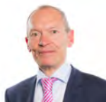
John Griffiths AM Welsh Labour Newport East