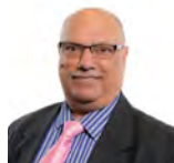
Mohammad Asghar AM Welsh Conservative South Wales East