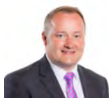
Darren Millar AM Welsh Conservative Clwyd West