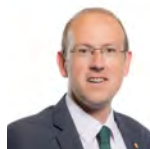
Llyr Gruffydd AM Plaid Cymru North Wales